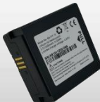
2880mAh Lithium Polymer Battery